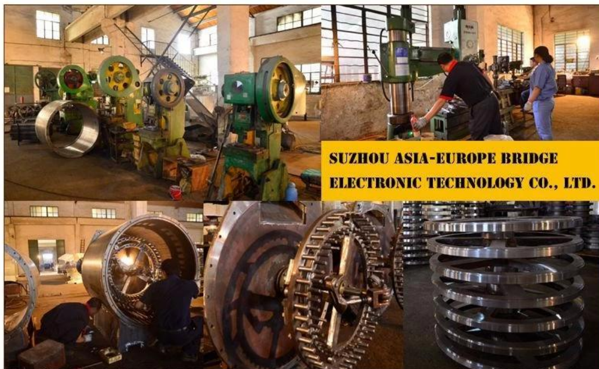
SUZHOU ASIA-EUROPE BRIDGE ELECTRONIC TECHNOLOGY CO., LTD.