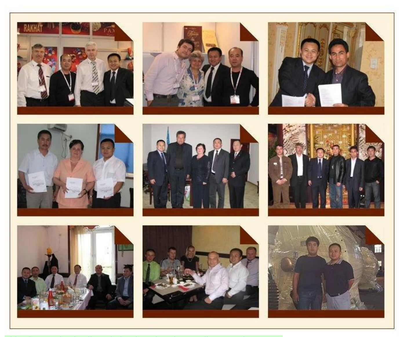
China bar production line wholesales, chocolate cooling tunnel company