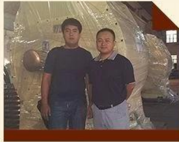
China ball mill machine company