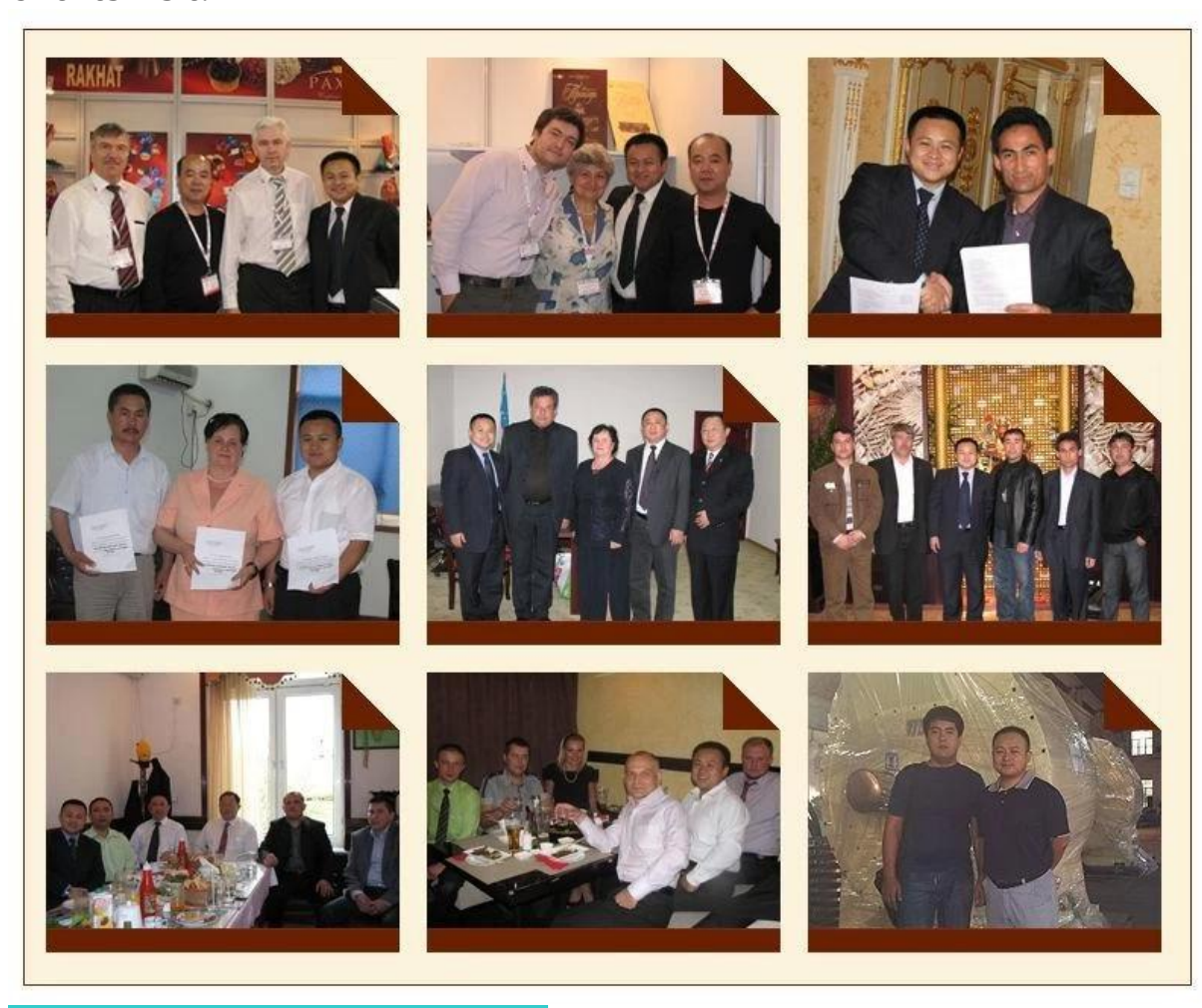
China ball mill machine company