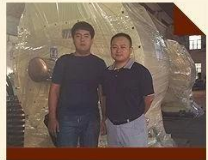
Automatic Chocolate Making Machine Manufacturers