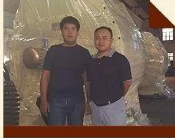
China ball mill machine company